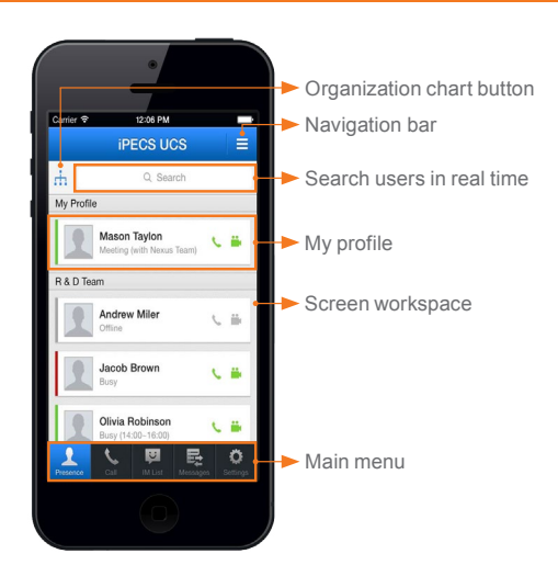
iPECS UCS Mobile Client for iOS