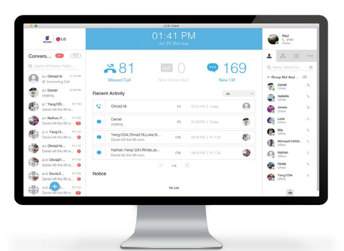
iPECS UCS Desktop Client for Mac